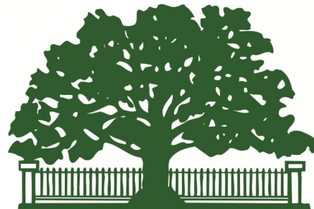
Silk screen note card image 2