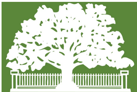
Silk screen note card image 1

Make check payable to Savannah Tree Foundation. Want to use a credit card? Call 912-233-8733